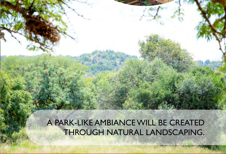
A PARK-LIKE AMBIANCE WILL BE CREATED THROUGH NATURAL LANDSCAPING.