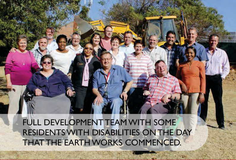
FULL DEVELOPMENT TEAM WITH SOME RESIDENTS WITH DISABILITIES ON THE DAY THAT THE EARTH WORKS COMMENCED.