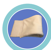
Cotton booster pad