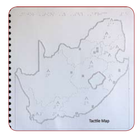
Fig. 2: Tactile map image.

The tactile atlas comprises an introductory section describing maps and how they are used to inform the